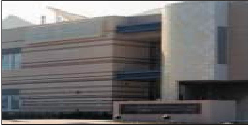
Anchorage Native Primary Care Center is located at 4320 Diplomacy Drive. ANPCC has improved the Primary Provider program.