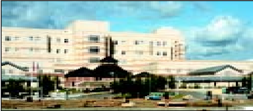
Pictured on the left is the Alaska Native Medical Center. Located across from ANMC is the Anchorage Native Primary Care Center.